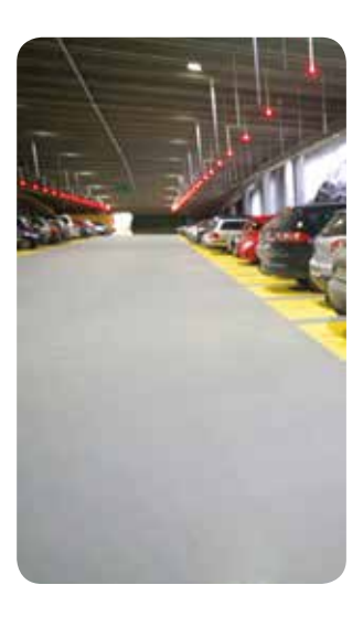
Intermediate Level Car Park Deck Systems