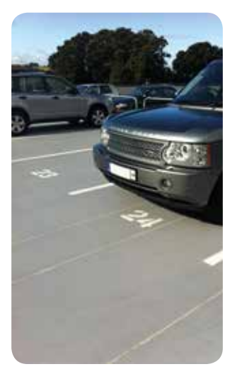
Roof Level Car Park Deck Systems