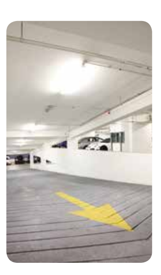
Heavy Duty Deck Systems for Ramps

This guide has been produced to give an overview of floor specification considerations when selecting suitable moisture-proofing and resin deck coating systems on lowest basement, intermediate and roof level decks of parking structures.