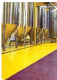
Bottling Plants & Brewhouses