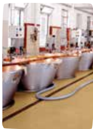
Dairy & Cheese Processing