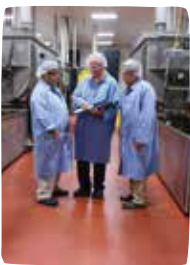
Meat, Poultry & Seafood