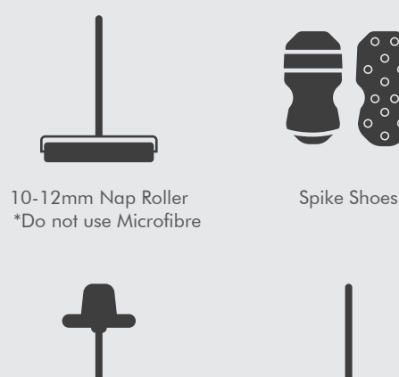
Slow Speed Drill with Helical Mixer Head

The following equipment is recommended for this application.